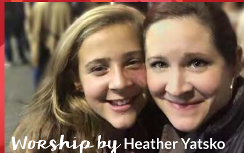
Worship by Heather Yatsko

Girls Only Fun! Mother/Daughter Spa Party · Sip and Paint Canvas Paintings (additional fee applies) Unique encouragement for the heart of moms & daughters!